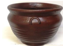
13.5 W x 10" H