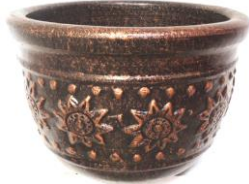
13.5" W x 10" H