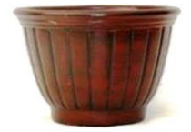
10" W x 8" H