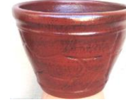
10.25" W x 8.5" H