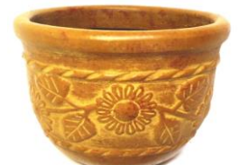
13.5" W x 10" H