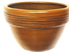
13.5" W x 10" H