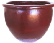
9.75" W x 8" H