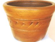
10.25" W x 8" H